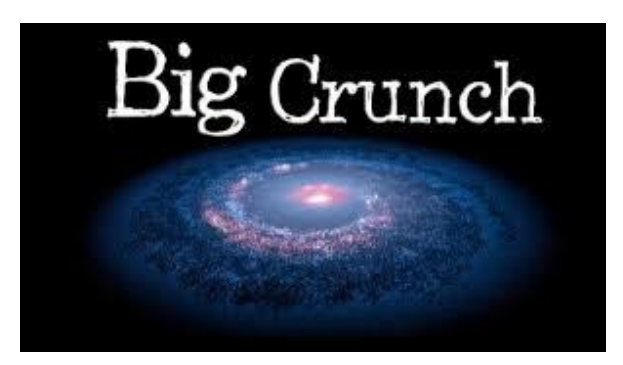
Fig. 2. Diposting oleh Agus Dwi Juli 18, 2020 Posting Komentar

Scientists say that when the mass of the universe becomes large enough, this expansion will finally end because the force of gravity causes it to collapse in on itself. It is believed that the universe is shrinking to an intense heat, which is known as the Big Crunch [5; 6].