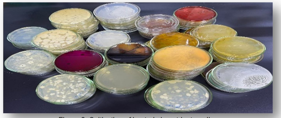
Figure 2. Cultivation of bacteria in nutrient medium

To create a favorable environment for the growth of bacteria, it was cultivated on a liquid nutrient medium for 3 days, 10 ml were taken and transferred to a liquid nutrient medium, cultivated 3 times with a change in the medium.